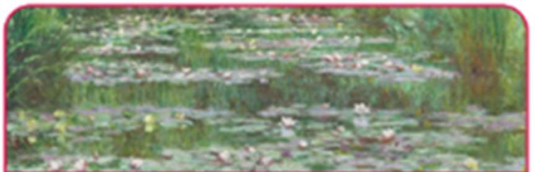
Claude Monet A French painter, and a founder of French Impressionist painting.