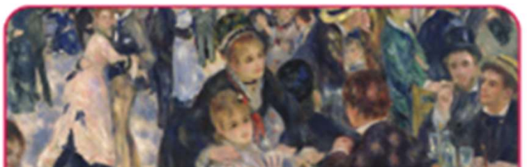
Auguste Renoir A French artist who led in the development of the Impressionist style.