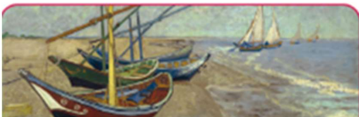
Vincent Van Gogh A Dutch painter and well-known Post-impressionist artist.