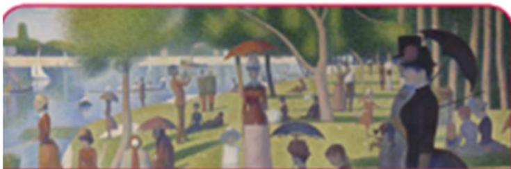
Georges-Pierre Seurat A French Post-impressionist artist.