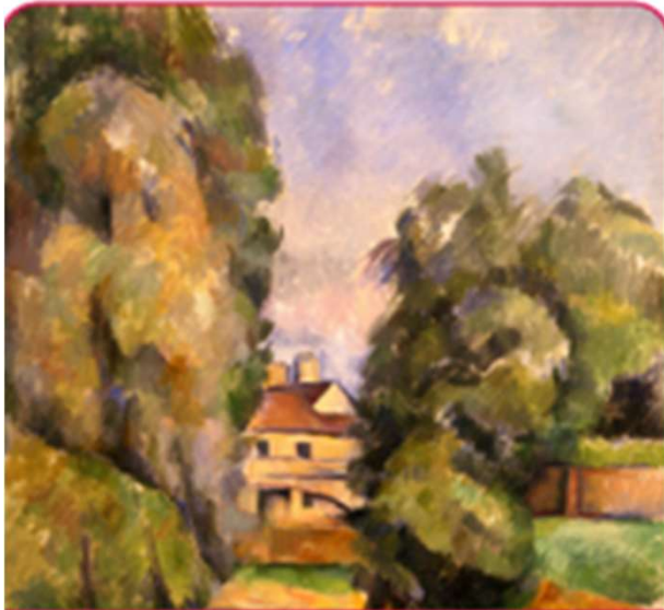
Paul Cezanne A French artist and Post-impressionist painter.

Title: Country House by the Water, c.1888