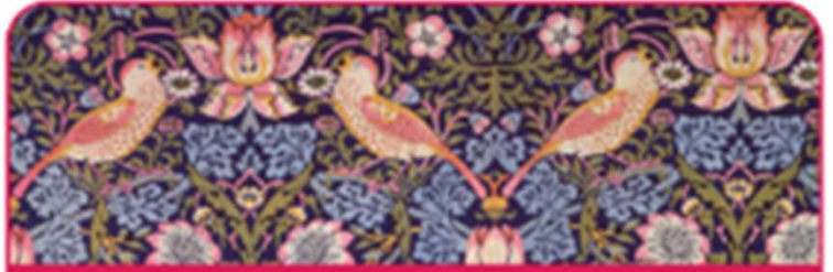
William Morris A British textile designer.