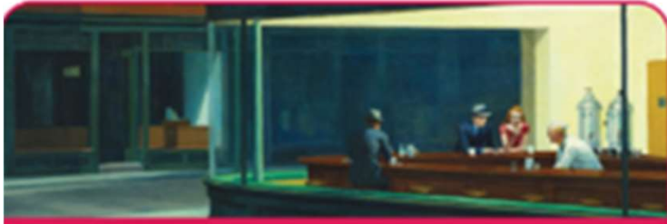
Edward Hopper An American realist painter and printmaker.