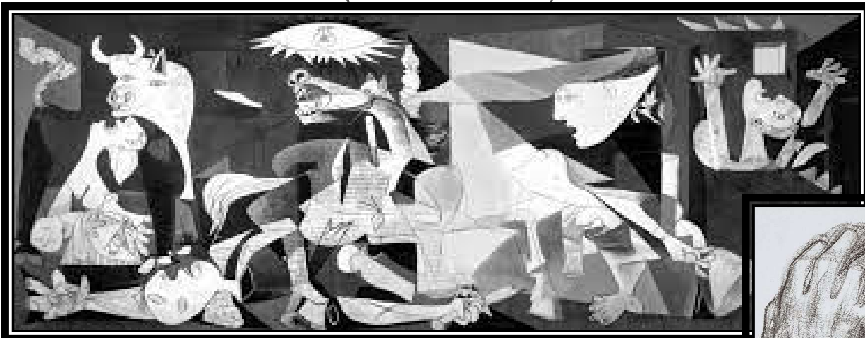
Guernica 1937 (Pablo Picasso)