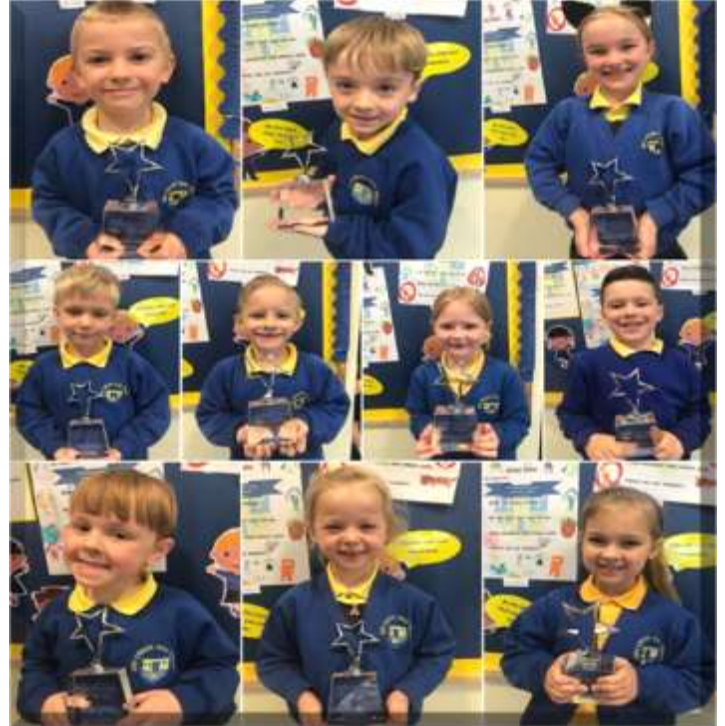
Pictured: Compassionate Year 2s at Gee Cross Holy Trinity School with their trophy