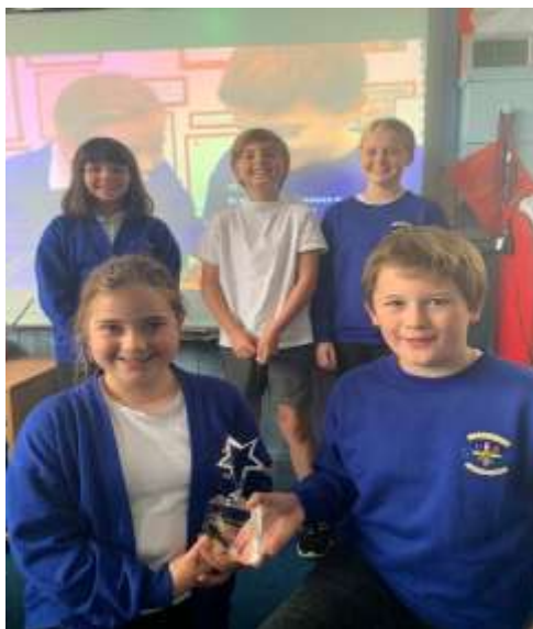
Pictured: Children from Furlanesend CP School with their Gold Impact Award