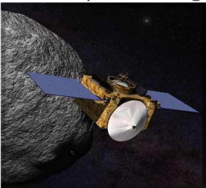
Pictured: NASA spacecraft Osiris-Rex orbiting asteroid Bennu